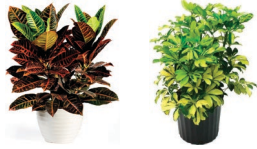
2' Green Plants