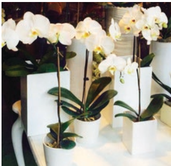
Single Phalaenopsis Plant Composition $60