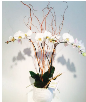
Double Phalaenopsis Plant Composition $90