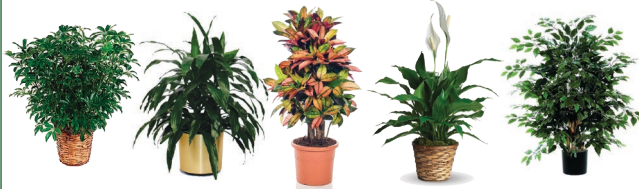
3' Green Plants