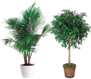
Standard 4' to 6' Green Plants

4' @ $59.95 each Qty: _____ @ $119.90 pair